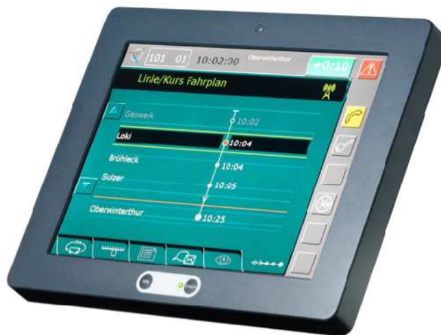
Touch screen for drivers of buses and tram, including schedule adherence information