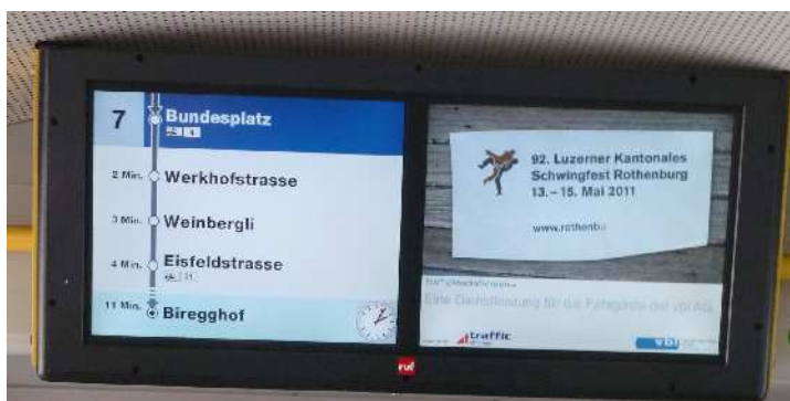
The screens inside all buses, displayed transport information and city information (managed by an external professional unit)