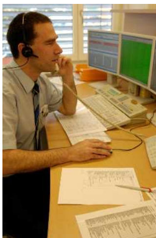
The control center with a high level of information to passengers