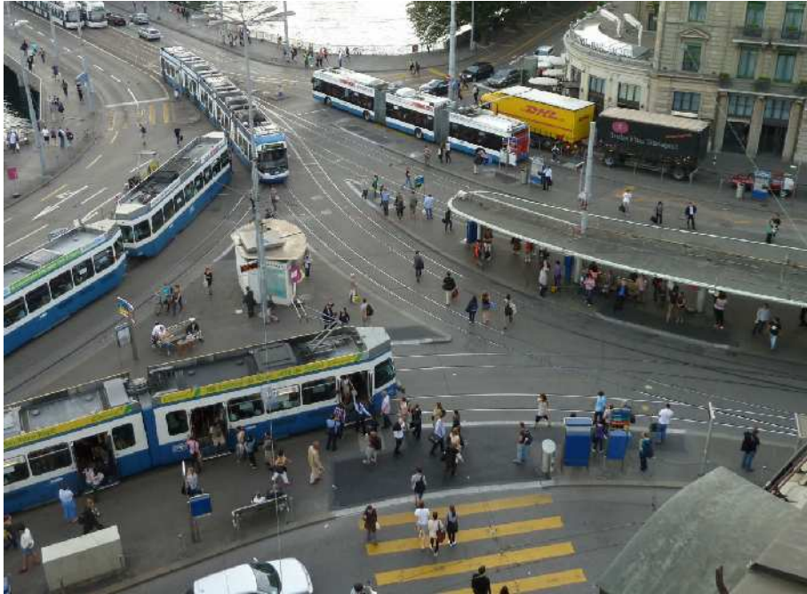
The bus and tram station “Central”, a complex node crossing without traffic lights, that needs the help of police men for regulation at rush hours only.