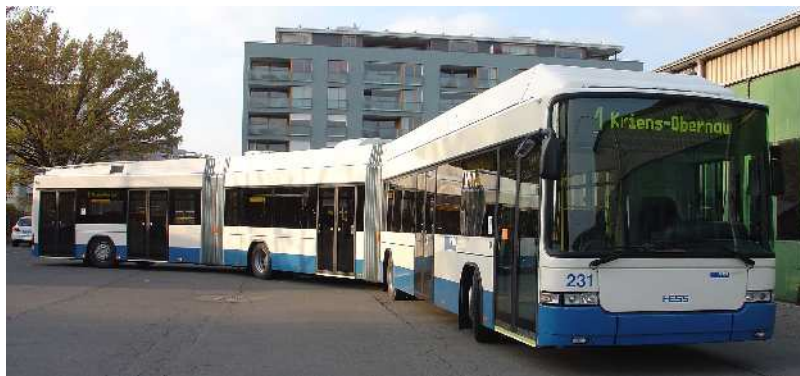
Double articulated trolley buses, in operation since 2006